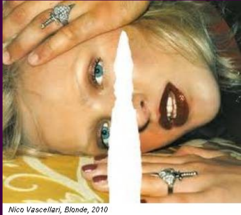
Nico Vascellari, Blonde, 2010