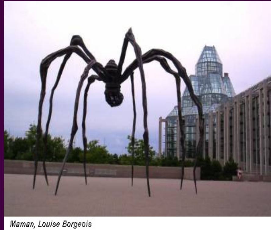
Maman, Louise Bourgeois