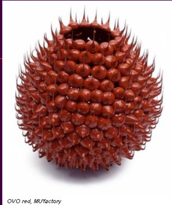
OVO red, MU'factory

“To the bottom of the Unknown, to find Something new” (C.Baudelaire)